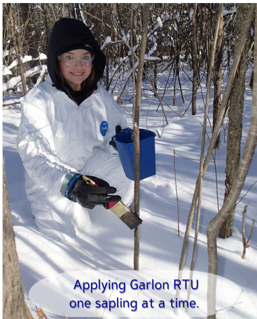
Applying Garlon RTU one sapling at a time.

And WE learn a lot from you, too, Cate. Actually, we are quite lucky at Wye Marsh. We learn a lot from all our volunteers. For that we say, "Thank you!"