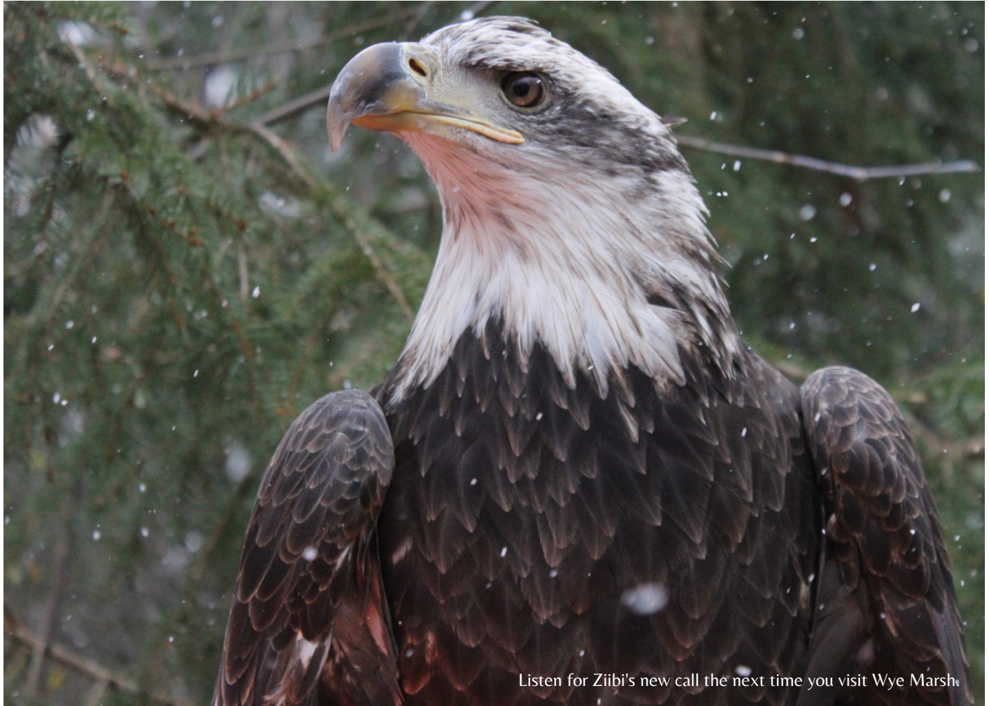
Listen for Ziibi's new call the next time you visit Wye Marsh.

THANK YOU FOR YOUR INTEREST IN THE WYE MARSH WILDLIFE CENTRE. OUR MONTHLY NEWSLETTER, "MARSH MATTERS", WILL KEEP YOU UP-TO-DATE ON WHAT IS HAPPENING AT WYE MARSH!